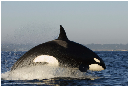
Orca (Killer Whale) ID Orcinus orca