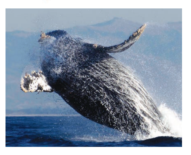
INSPIRING THE PUBLIC TO PROTECT OUR OCEAN, WHALES AND DOLPHINS